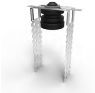
Typical application of sound insulating gypsum board ceilings

Maximum Load 20 daN Natural Frequency: 15 Hz