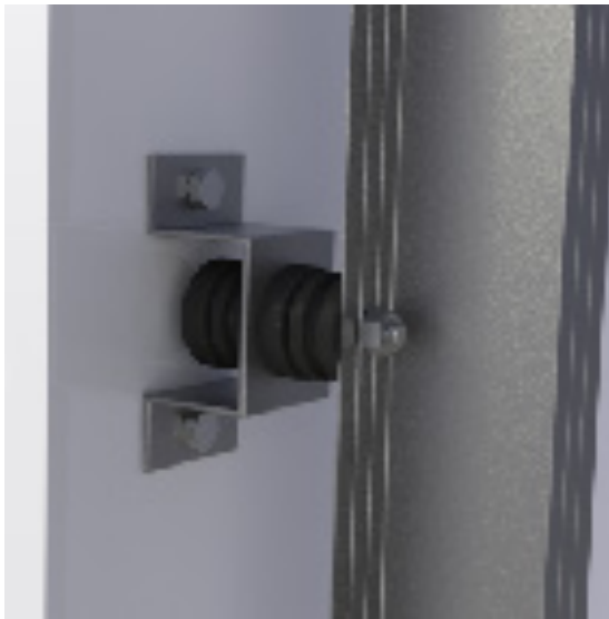
Vibro- WB Selection Table